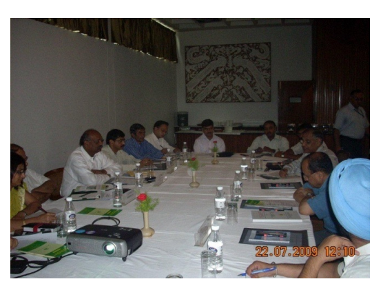
Natural Resource Management